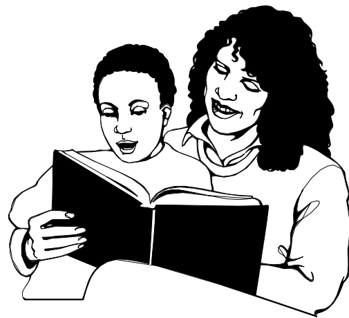
A boy sits on his mother's lap to read a story.